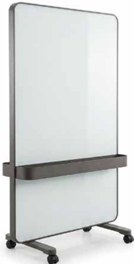
Screen Partition Front Whiteboard + Back PET + Grooves on Both Sides