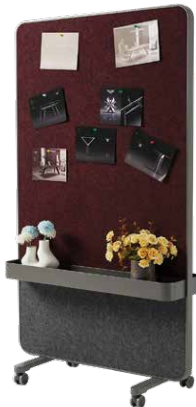
Screen Partition Front PET + Back PET + Grooves on Both Sides